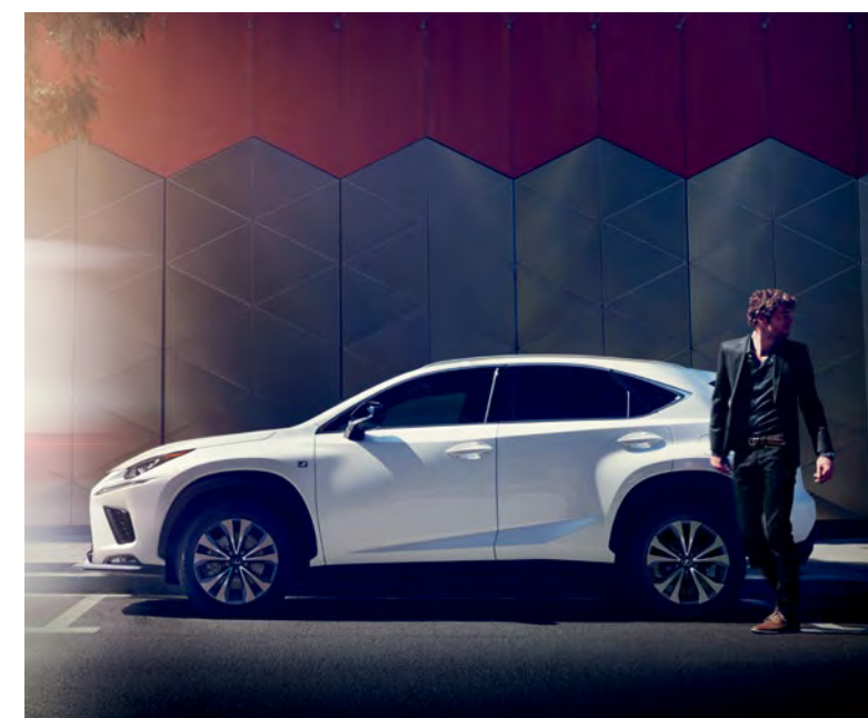
NX F SPORT shown in Ultra White 10

Experience LED illumination that catches eyes. And thoughtful details that open them.