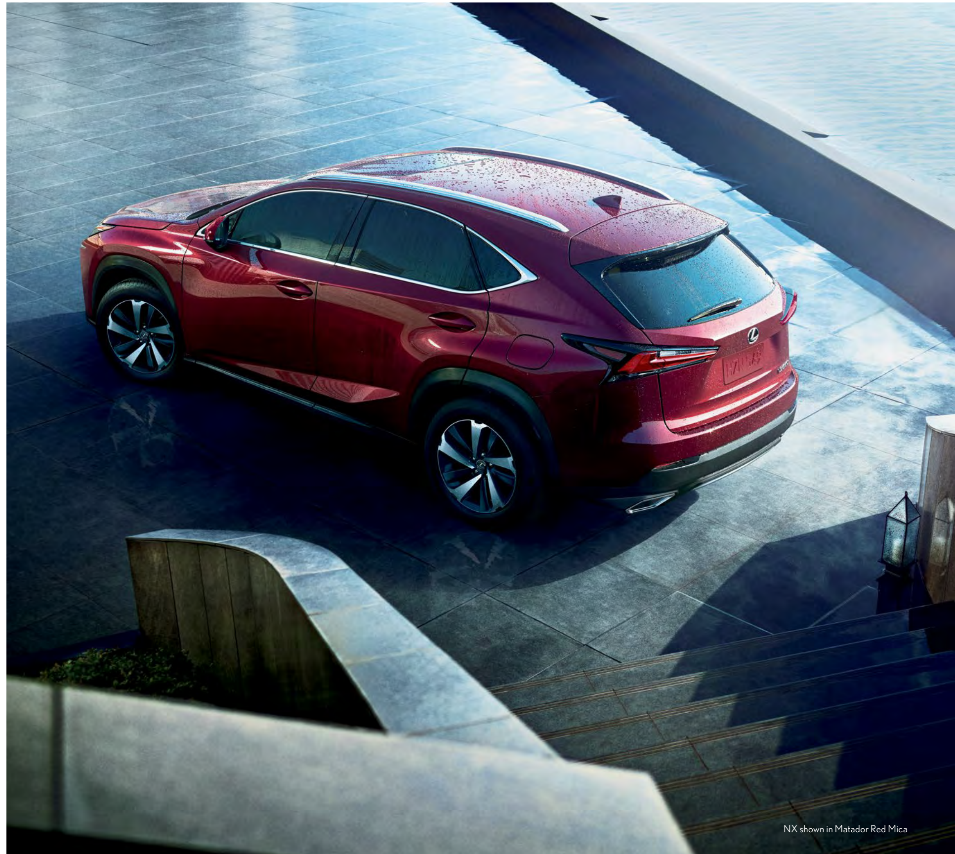
NX shown in Matador Red Mica

Split-five-spoke alloy wheels with Gloss Black and machined finish and all-season tires NX F SPORT