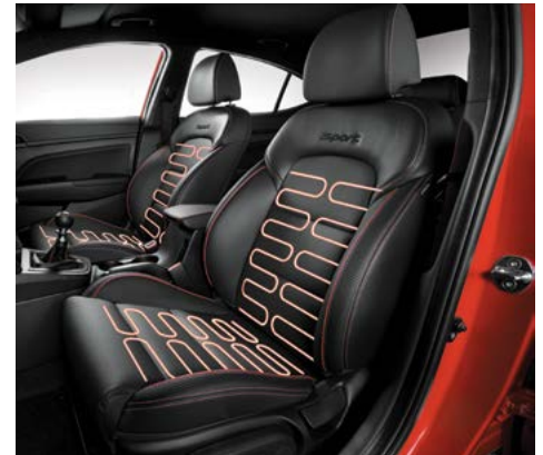
Standard leather heated front sports seats