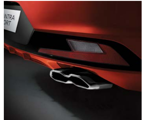
Standard chrome-tipped sport exhaust