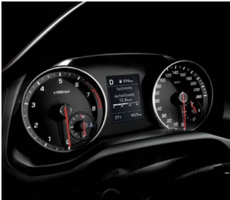
Standard sport instrument cluster