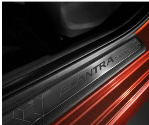
Standard sport exclusive door sills