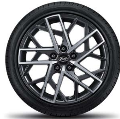
Standard 18" alloy wheel