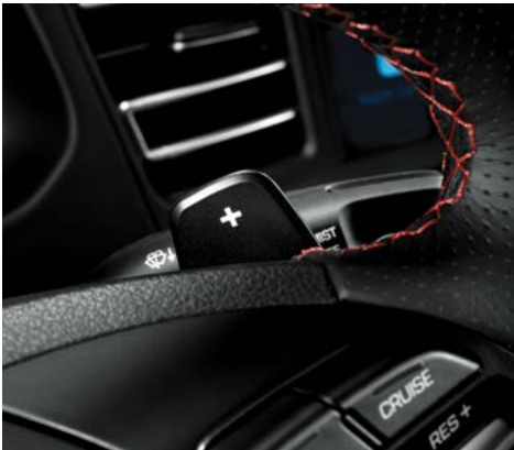
Available steering wheel-mounted paddle shifters