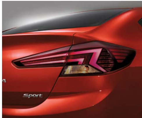
Standard LED tail lights