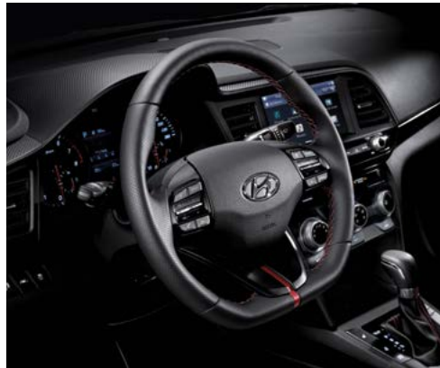
Standard sport D-cut heated steering wheel