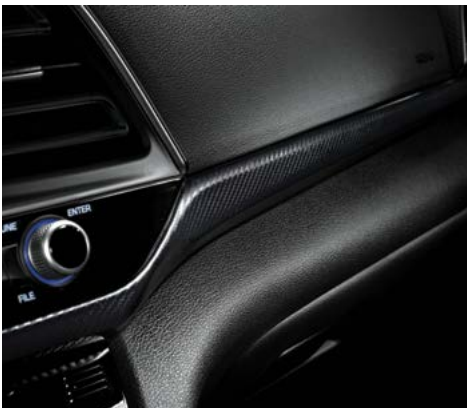
Standard sport-inspired accent trim