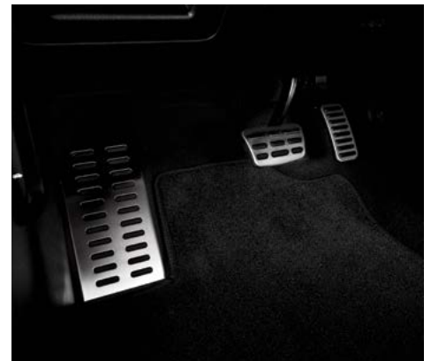
Standard aluminum sport pedals