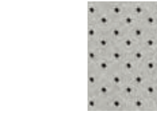
Laguna leather with perforated inserts — Ski Grey with Ski Grey embroidered Summit logo and accent stitching and Indigo Blue piping Available on Summit with Laguna Leather Package