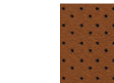
Nappa leather-faced with perforated suede inserts — Sepia with Silver embroidered SRT or Trackhawk logo and Tungsten accent stitching Standard on SRT and Trackhawk