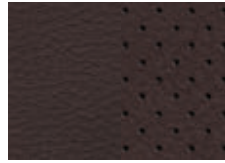
Natura Plus leather with perforated inserts — Jeep Brown with Jeep Brown embroidered Summit logo, Copper accent stitching and Jeep Brown piping Standard on Summit