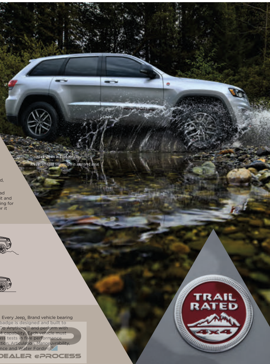
Trailhawk shown in Bullet Metallic. Always Off-road responsibly in approved areas.