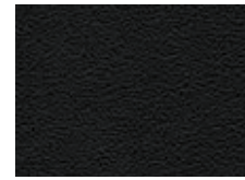
Leather-faced — Black Standard on Limited and Limited X