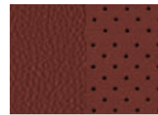
Laguna leather with perforated inserts — Demonic Red with embossed Trackhawk logo and Tungsten accent stitching Available on Trackhawk