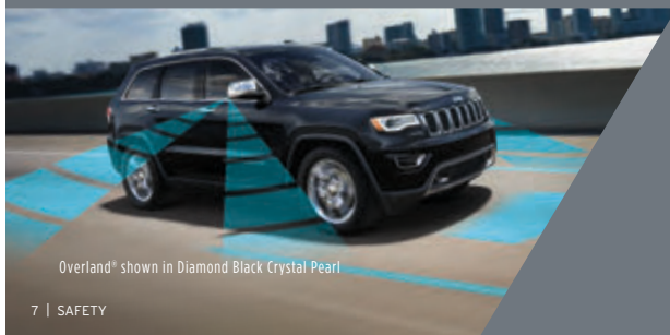
Overland ® shown in Diamond Black Crystal Pearl

Crosswinds or traffic hold no sway over you and your payload. As part of ESC, 14 TSC monitors the vehicle's movement relative to your intended path, applies alternating brake pressure to slow the vehicle, then increases the pressure on one front wheel to counteract the sway induced by the trailer.