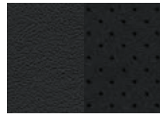
Nappa leather-faced with perforated suede inserts — Black with Ruby Red embroidered Trailhawk® logo and accent stitching Standard on Trailhawk