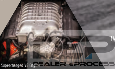
6.2L Supercharged V8 Engine