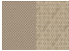
Premium cloth — Light Frost Standard on Laredo