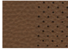
Natura Plus leather with perforated inserts — Tan with Tan embroidered Summit logo and Black accent stitching and piping Standard on Summit