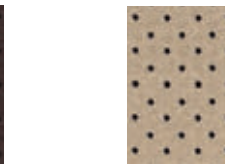
Nappa leather-faced with perforated inserts — Light Frost with Light Frost accent stitching (Light Frost embroidered Overland logo and Jeep Brown piping on Overland) Standard on Overland; Available on Limited with Luxury Group II