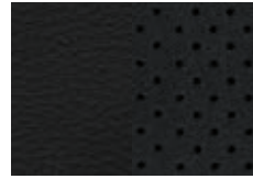
Natura Plus leather with perforated inserts — Black with Black embroidered Summit® logo and Tungsten accent stitching and piping Standard on Summit