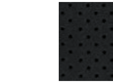
Nappa leather-faced with perforated inserts — Black with Black accent stitching on Limited; Black embroidered Overland® logo and Tungsten accent stitching on Overland Standard on Overland and High Altitude; Available on Limited with Luxury Group II