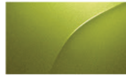
Alien (M) BC/BL