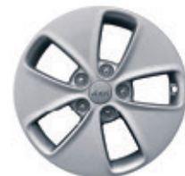
16" alloy wheel