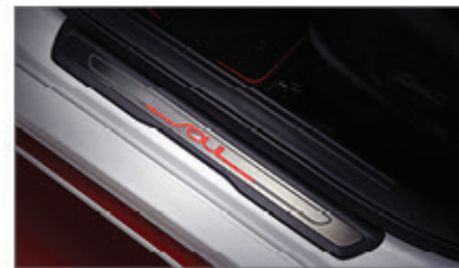
Illuminated door sill plate