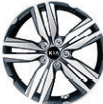
18" machine-finished alloy wheel