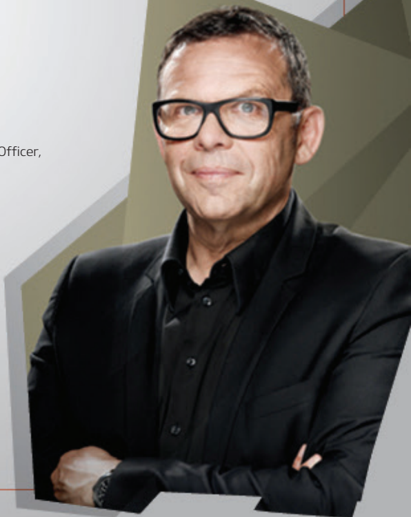
PETER SCHREYER President and Chief Design Officer, Kia Motors Corporation

To ensure that the 2015 Kia Soul exceeds the highest standards of design, technology and quality, Peter Schreyer — one of the world's top 3 automotive designers — thoroughly oversees every aspect in its design direction. For Schreyer, each element should bear the 'absolute purity' in order to create the design as a whole. The 'simplicity' philosophy is at the core of Kia's creative language.