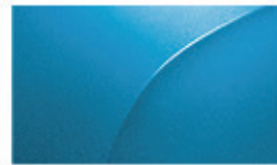
Caribbean Blue (M) BC/BL