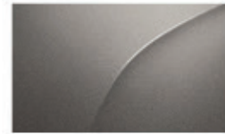
Titanium (M) BC/BL