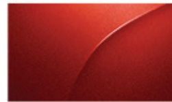
Inferno Red BC/BL