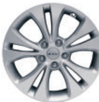
17" alloy wheel