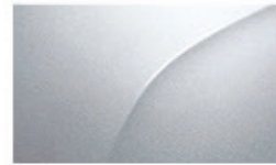
Sterling (M) BC/BL