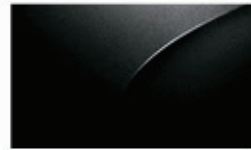
Onyx (P) BC/BL