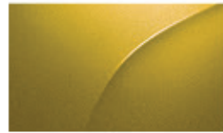
Solar Yellow BC/BL