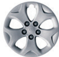
16" steel wheel