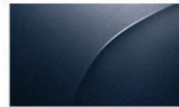
Fathom Blue (P) BC/BL